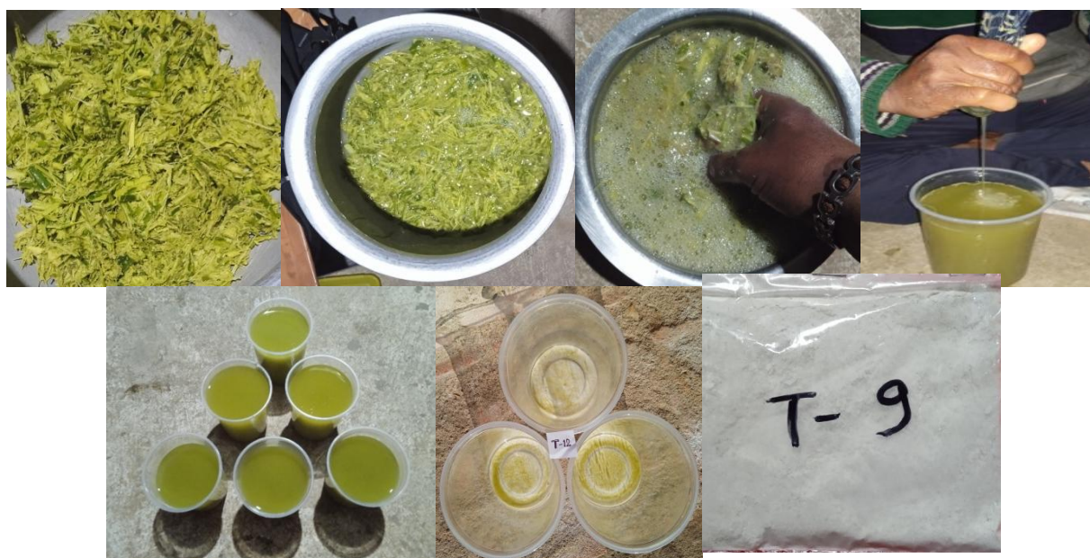
Fig.: Procedure for preparation of Giloy-satva