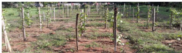
Photos 1: Experimental plots at Botanical Garden, V.B.U. Hazaribag, Jharkhand, India

Details of treatments were T 1 – Control, T 2 - Farm Yard Manure (FYM): 10 t ha -1 (recommended); T 3 - Farm Yard Manure (FYM): 5 t ha -1 , T 4 - Vermicompost: 5 t ha -1 , T 5 - Sunflower Cake: 5 t ha -1 , T 6 - Mahua Cake: 5 t ha -1 , T 7 - Linseed Cake: 5 t ha -1 , T 8 - Karanj Cake: 5 t ha -1 , T 9 - Mustered Cake: 5 t ha -1 , T 10 - Neem Cake: 5 t ha -1 , T 11 - Azotobactor: 5 g/plant, and T 12 - Tricoderma: 5 g/plant. Irrigation was given as per the requirements of the crop. The stem of the Giloy was harvested after 20 months of transplantation during the month of December, 2022. The data was subjected to ANOVA analysis, and critical difference values will be tabulated at the five percent level of significance of the corresponding degree of freedom.